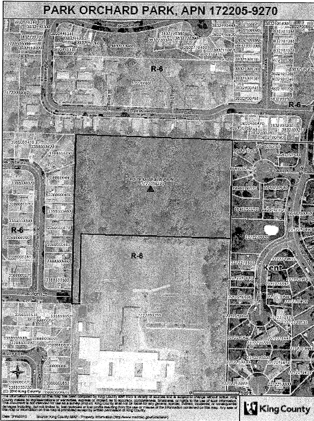
Image below is a color aerial photo of the area as described above.