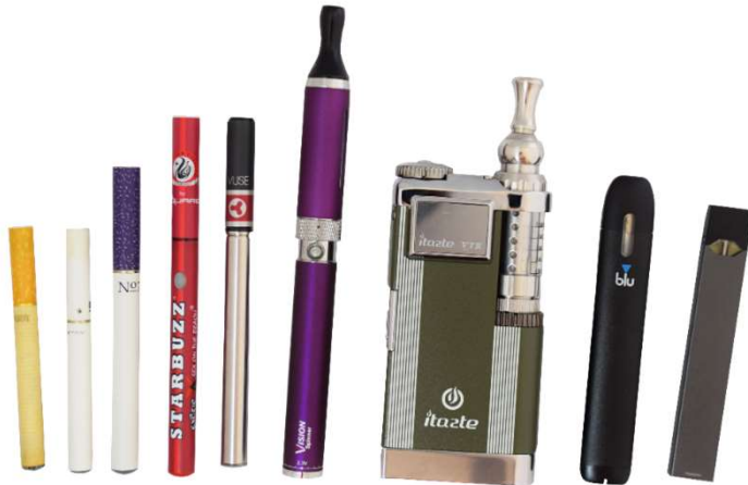
Electronic smoking devices (vapor products)