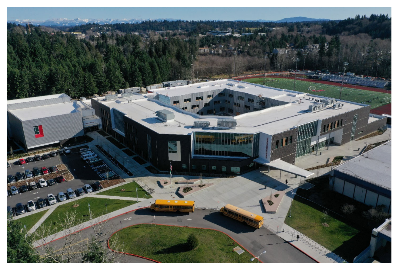
Juanita High School – Phase II To Open Fall 2020