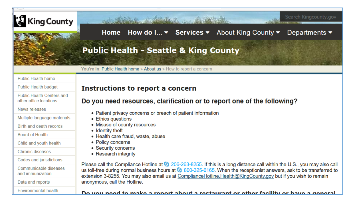
Figure 3: Department of Public Health HIPAA Compliance Contact