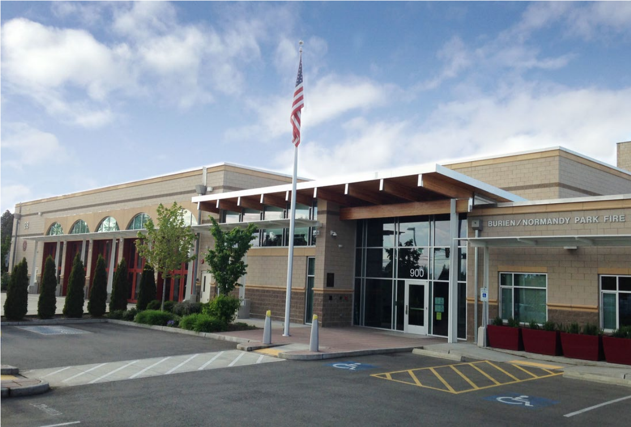
Photo of Property

Property Owner: King County Fire District #2 Address: 900 SW 146 th Street, Burien, 98166 Cost Per Sq. Ft.: $1,152 per month for 740 square feet of shared space. Operational Costs: N/A Term: June 1, 2021 through May 31, 2026 with option to extend through May 31, 2031 Square Footage: 740 square feet. Council District: Eight Funding Source: EMS Levy funding Previous Location: N/A, extension of agreement at current location