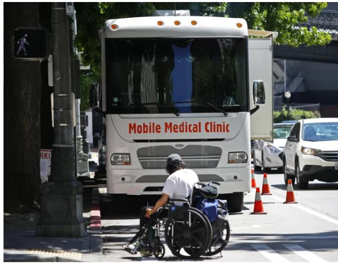
1 of 3 | King County currently has a mobile medical van to treat wounds and prescribe medication-assisted treatment downtown, but the new "street medicine" team will expand on those efforts and take outreach into shelters... More

Aug. 12, 2019 at 6:00 am | Updated Aug. 22, 2019 at 10:04 am