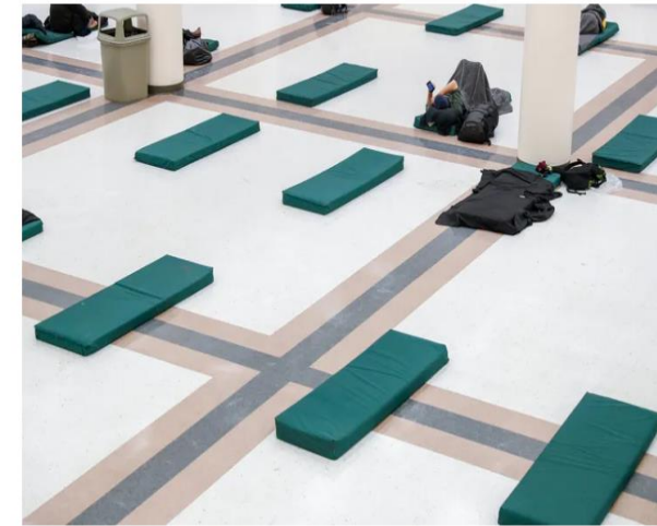
Mats are laid out on the floor of the Seattle Center Exhibition Hall on Dec. 28. The Exhibition Hall will be open as an overnight warming shelter through next Wednesday for at least 100 adults.

Feb. 22, 2023 at 7:12 am | Updated Feb. 22, 2023 at 4:13 pm