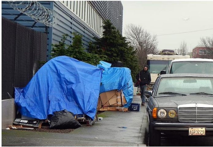
Homeless encampment along a road in the Sodo area of Seattle.