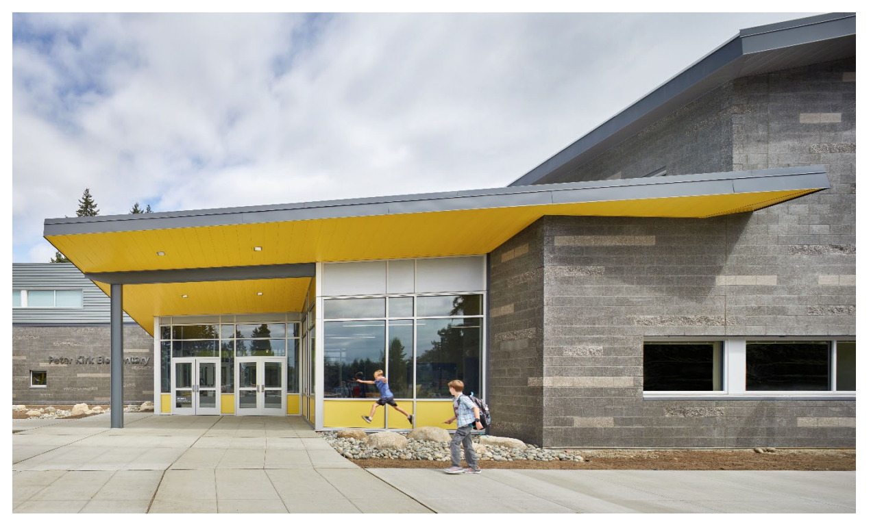
Peter Kirk Elementary School – Opened Fall 2019