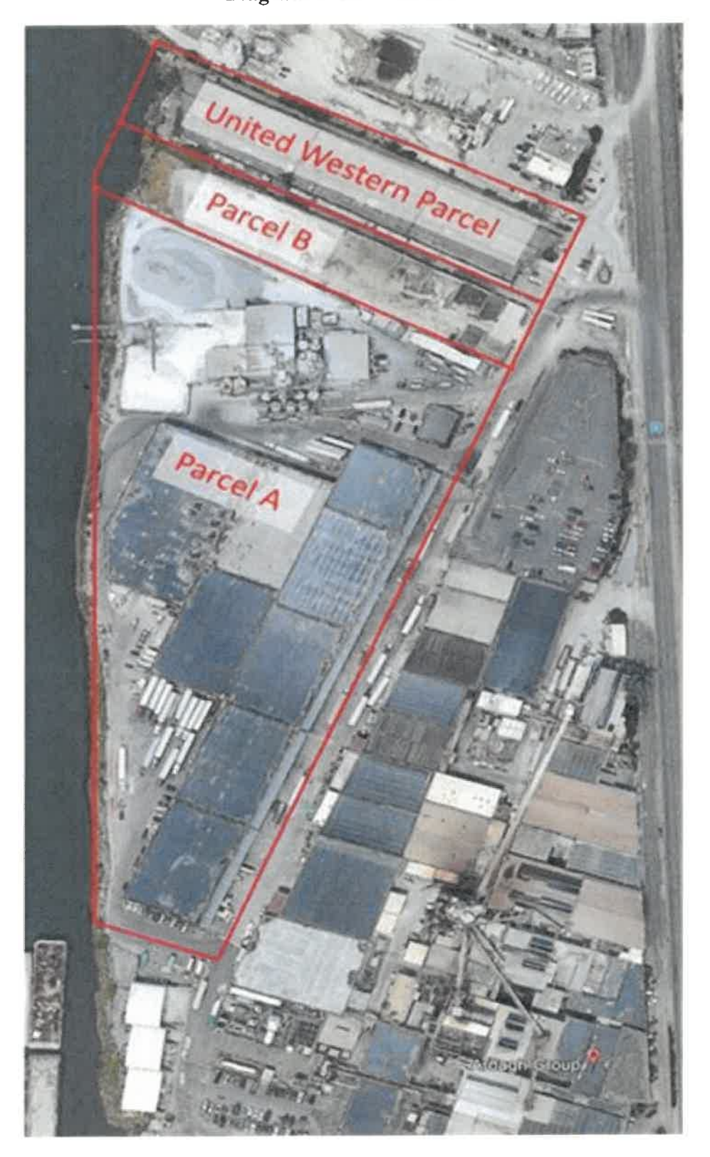
Exhibit B Diagram of the Premises