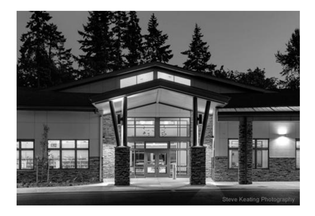
Board Adopted: August 23, 2010