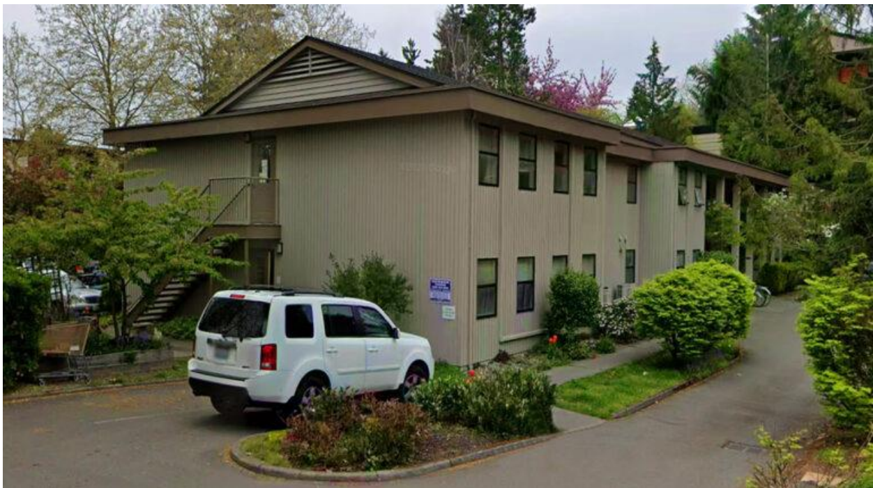
Figure 1. Photograph of Cascade Hall (Northgate neighborhood in Seattle).

Cascade Hall Mental Health Residential Treatment Facility [$6,000,000]. The proposed appropriation would support the county's purchase and possible renovation of the Cascade Hall mental health residential treatment facility located in the Northgate neighborhood in the City of Seattle 18 . Figures 1 and 2 below provide a photograph and map of the facility. Cascade Hall is a 64-bed mental health residential facility providing 24/7 mental health support and services to high-risk individuals. Sound (formerly Sound Mental Health) has owned and operated the facility since September 2019 as it acquired the facility after merging with Community Psychiatric Clinic. According to the county's parcel viewer 19 , the property has been operating as a mental health facility since 1990. The current Department of Assessments assessed value of the property is $6,014,400.