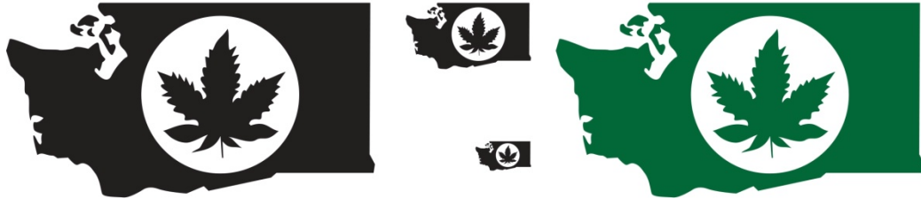
Produced in Washington Icon 3" / 1" / .5" / green