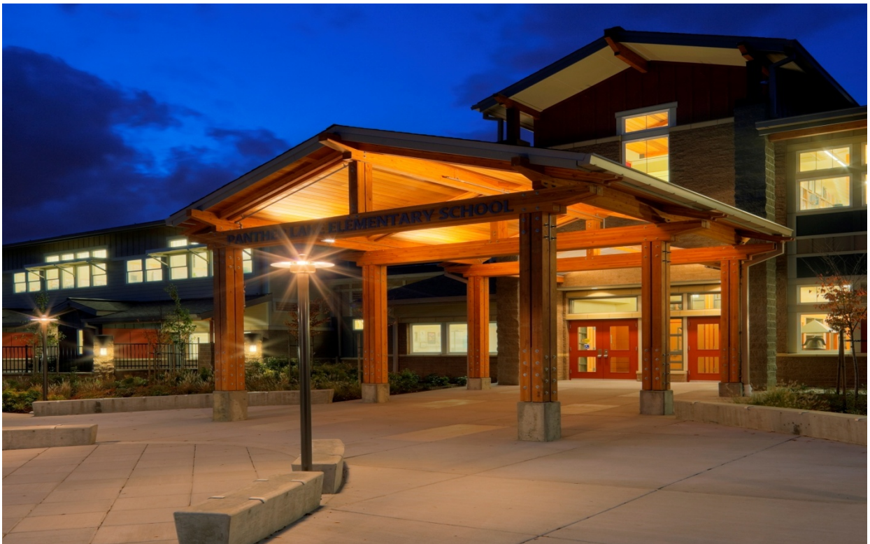
New Panther Lake Elementary School opened in Fall 2009

Kent School District No. 415 provides educational service to Residents of Unincorporated King County and Residents of the Cities of Kent, Covington, Renton, Auburn Black Diamond, Maple Valley, and SeaTac, Washington