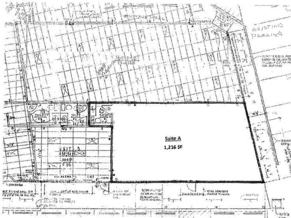
EXHIBIT B Diagram of Premises

Landlord Initial EEF Tenant Initial _____