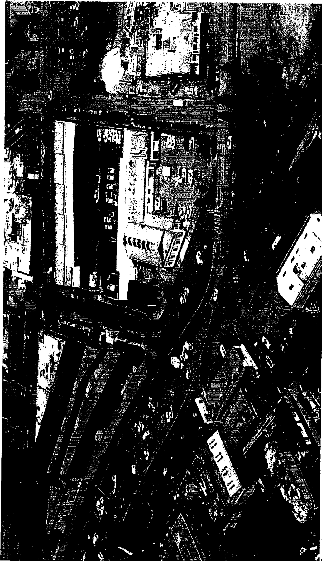
Attachment 1. Existing Aerial View North Lake Union Upper Parcel

North Lake Union-Upper Parcel- Maintenance and Repair Facility KING COUNTY DEPARTMENT OF TRANSPORTATION – Metro Transit Division Specifications for a Required Public Viewing Platform