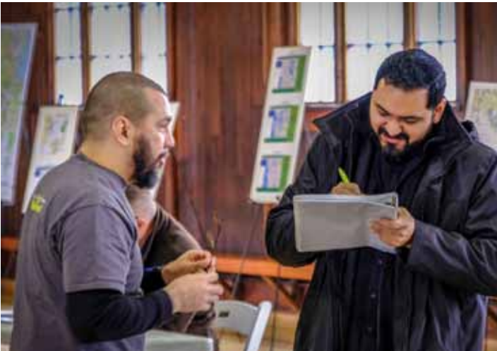
3,500 residents participated in job fairs and other employment events supported by COO.

COO helped organize 27 community-based, workforce development events where 3,500 residents participated in job fairs, apprenticeship events, and skills training, leading to new job training and employment opportunities. The approach brought together the WorkSource system, community partners, training providers and employers, a model that coordinates resources across the county and creates more equitable access to opportunities.