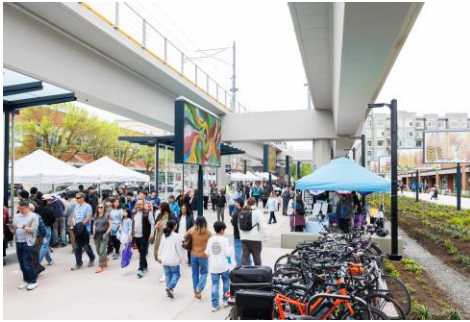
Ex: Redmond Opening