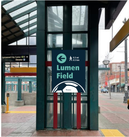
International District / Chinatown Station