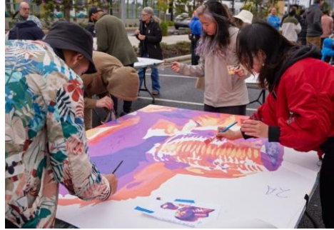
Ex: Starter Line Opening