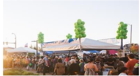
Ex: Lynnwood Opening