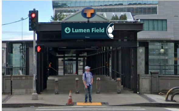
Weller St Bridge / King St Station