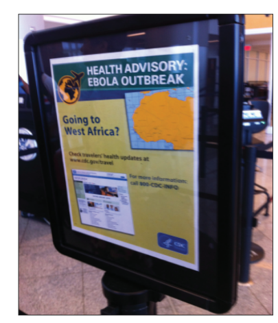
Health advisory for airline travelers