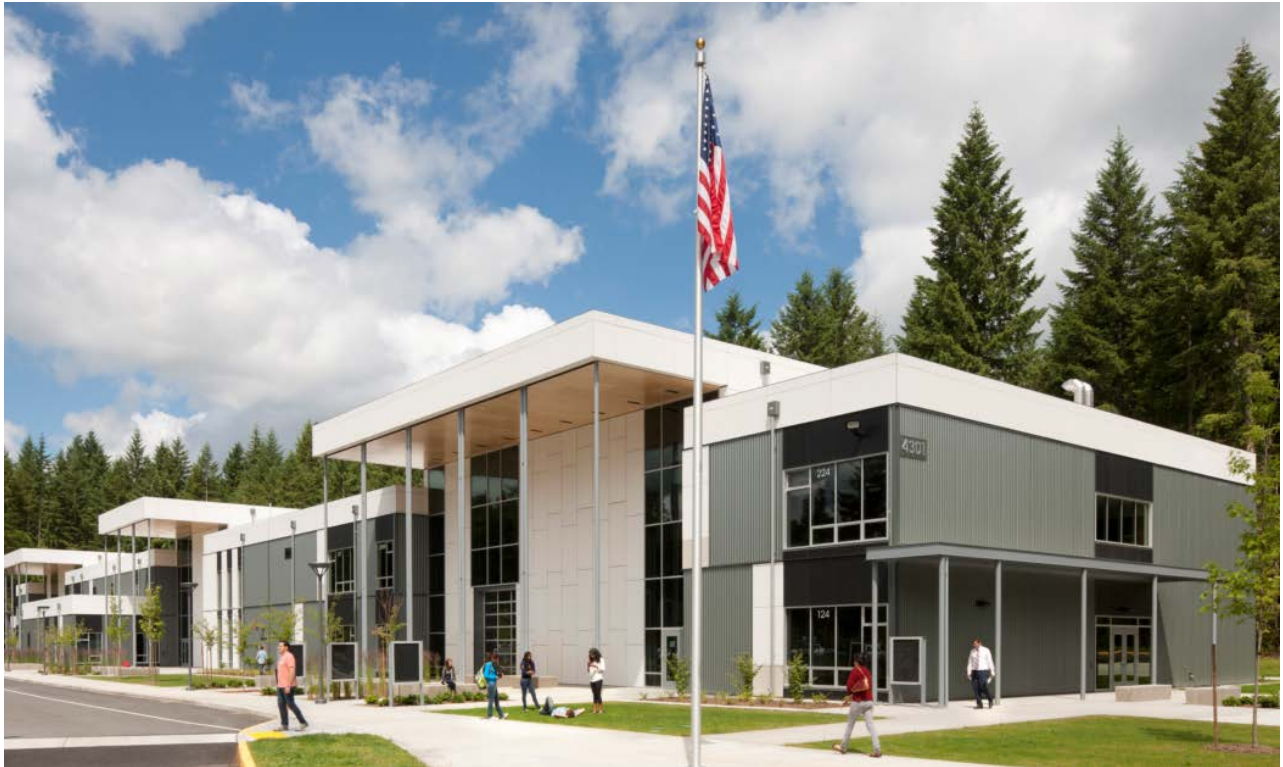
Nikola Tesla STEM High School