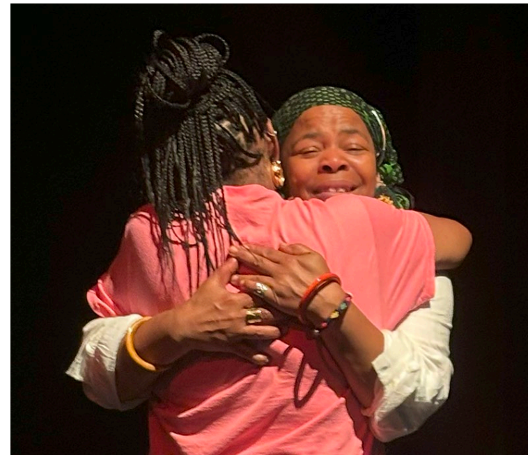
The Genius Conference at the Langston Hughes Performing Arts Institute, June 7-8 2023.

Pilot learnings informed the 2024 Public Free Access, and the broader program developed for Doors Open.