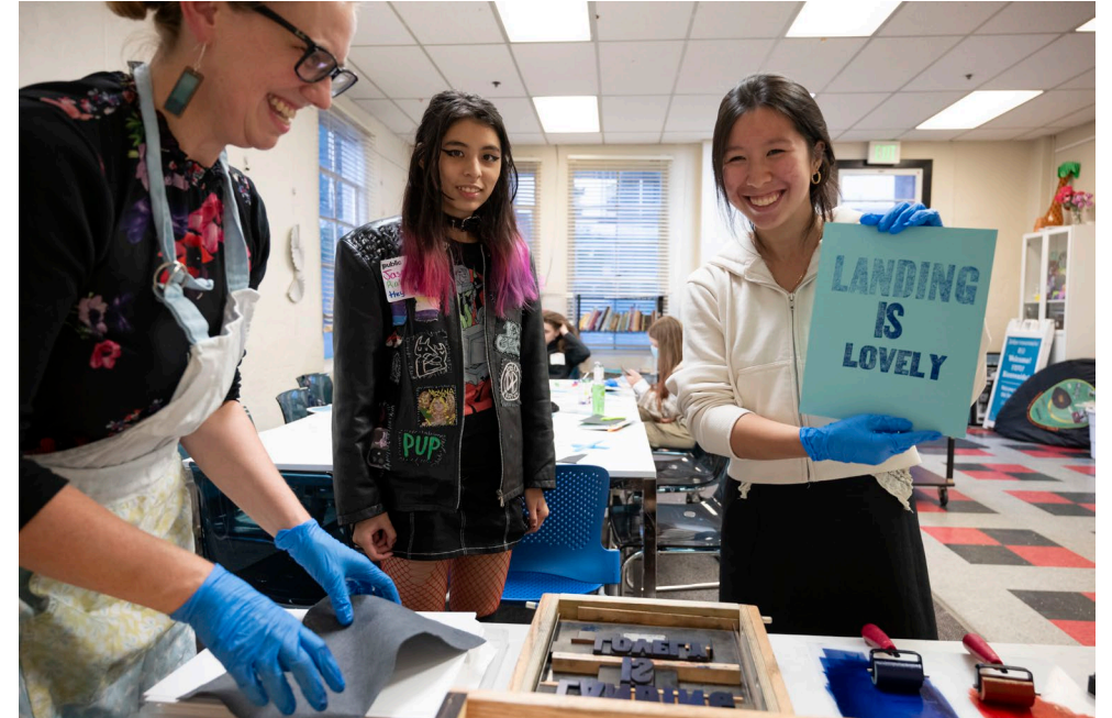
Poetry in Public Youth Community Poetry Workshop In Redmond, 2023.