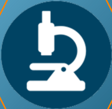
PUBLIC HEALTH LAB