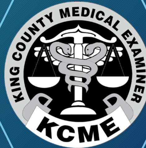
MEDICAL EXAMINER'S OFFICE