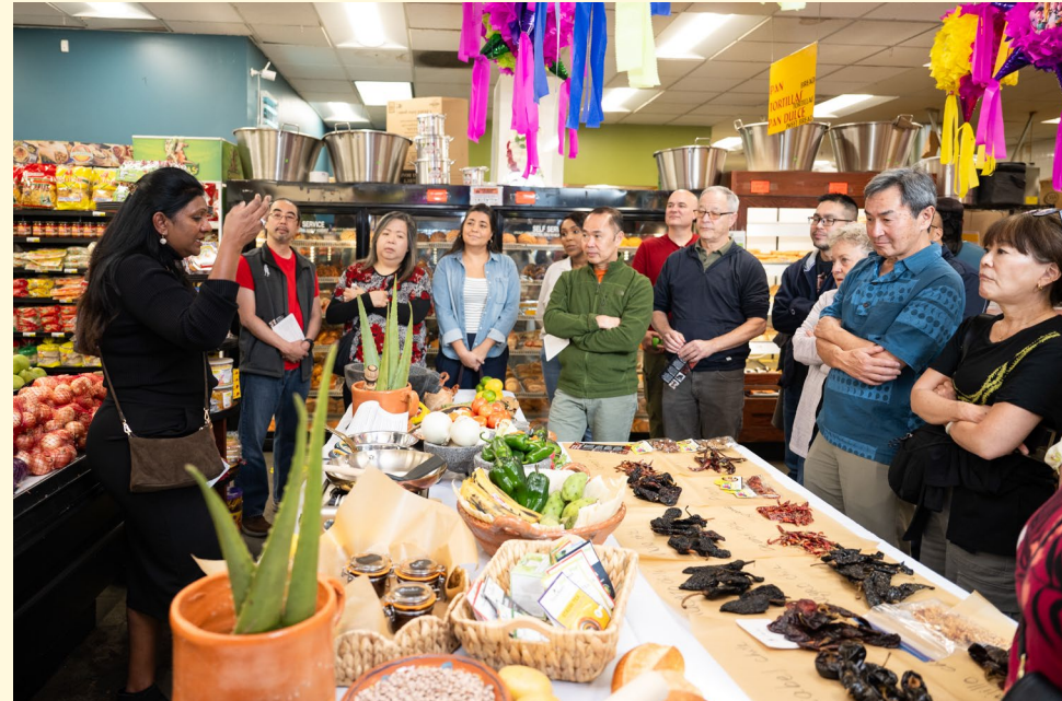
Savoring Nepal, Culture Generation – Kent, 2025.