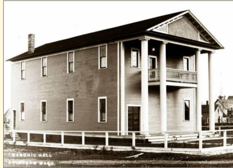
Photo of Historic Masonic Lodge, 1909 and the building in 2025 with the deck being replaced.