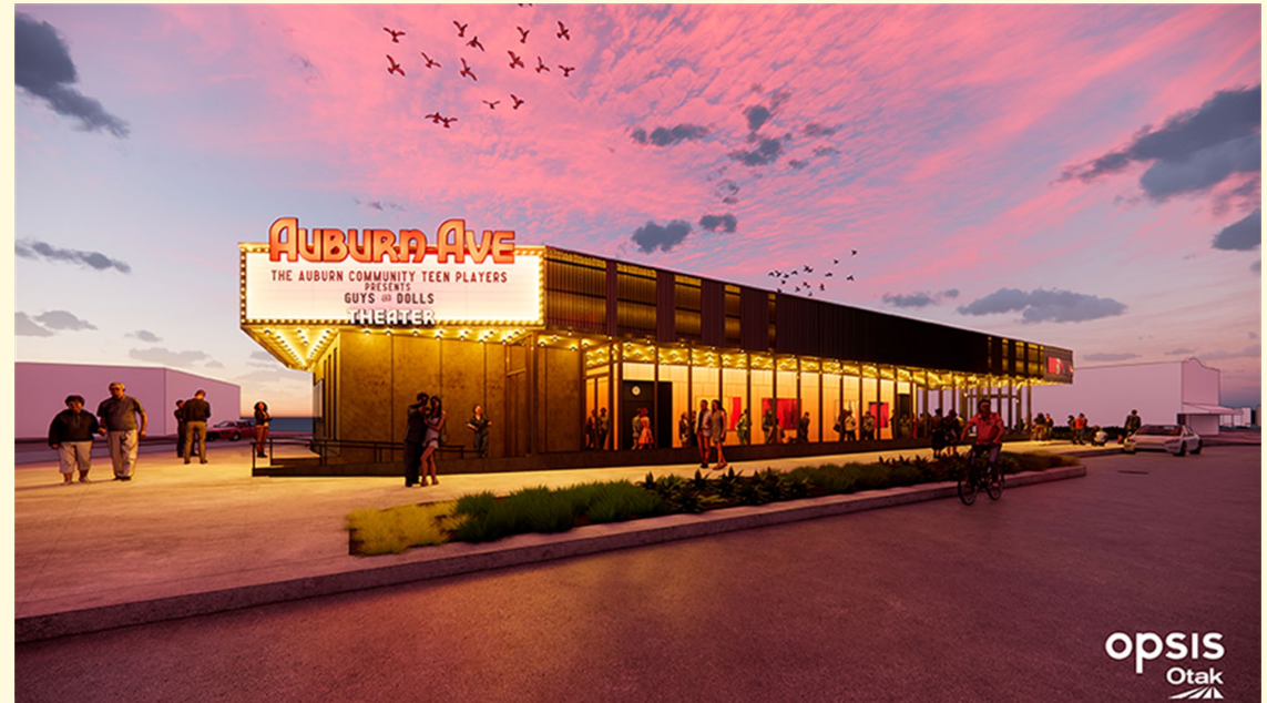
Rendering of Auburn Ave from SW Entrance, Opsis Architecture 2026.