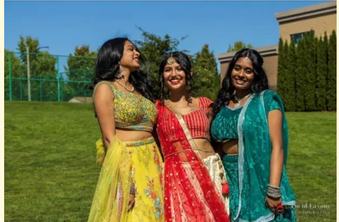
Block Party Dancers. Photo by Lucid Layout Photography, 2025.