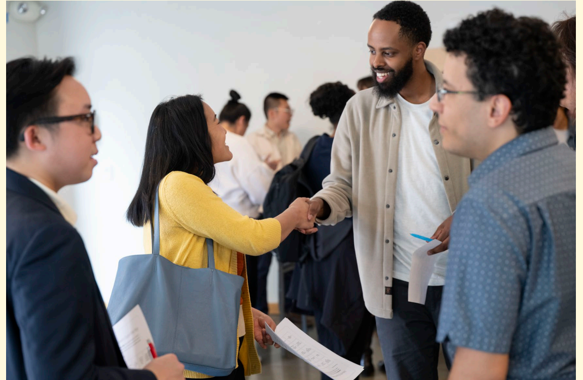
Priority organization and consultant roster mixer, 2025.