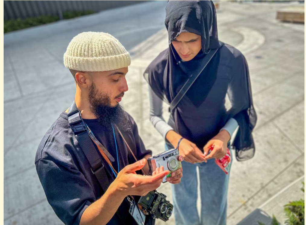
Youth in Focus Beginners Dark Room Summer Camp, 2025.