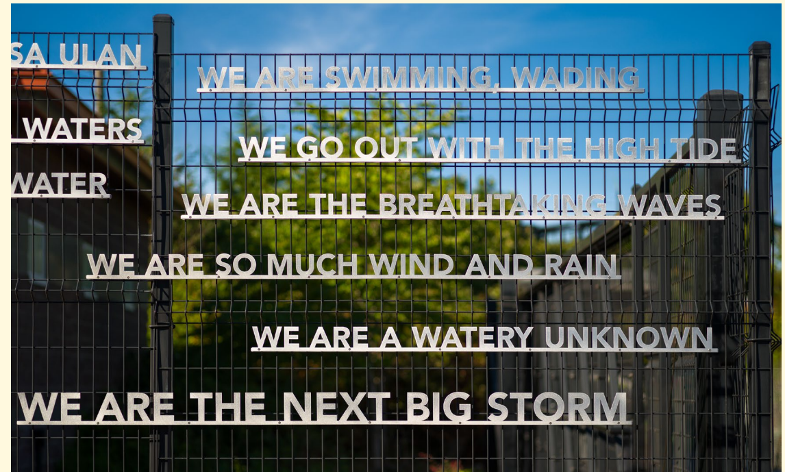
AREA C Projects. Water Log (detail), 2025. Aluminum. King County Public Art Collection, Rainer Valley Wet Weather Storage, Seattle WA.