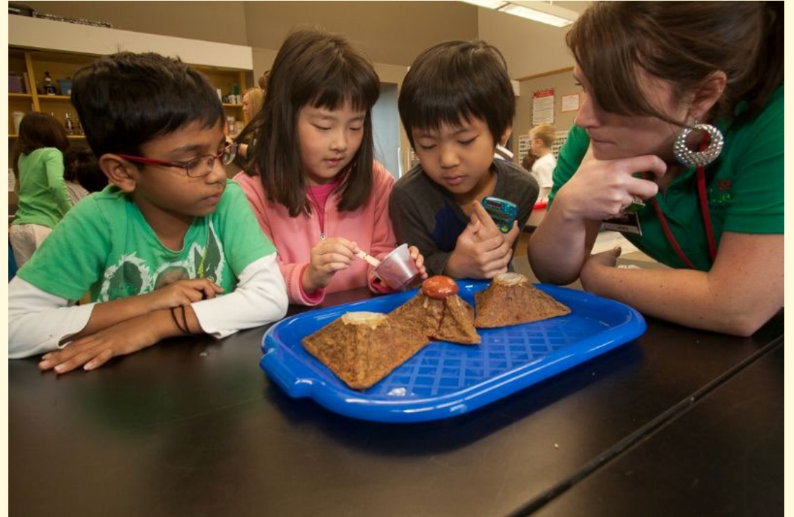
School Field trip to KidsQuest Museum, 2025.