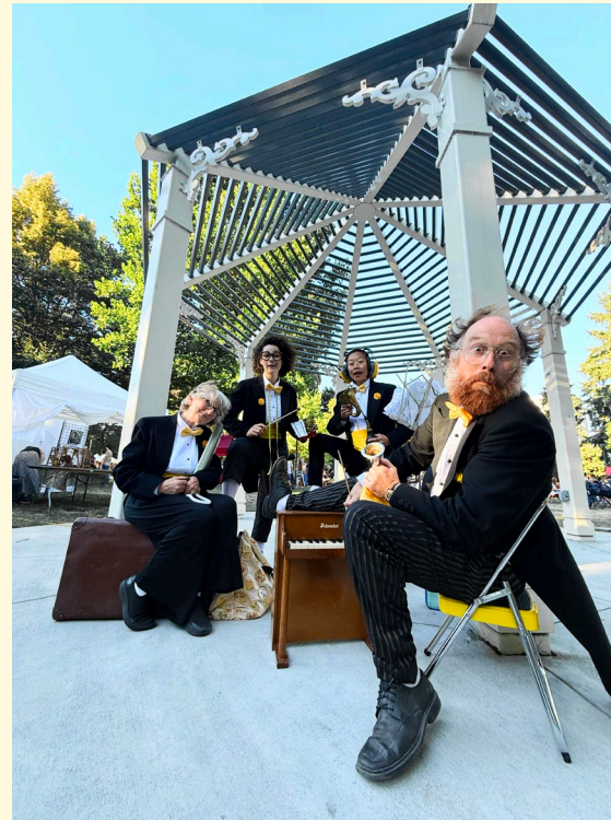
Hobart-based group, Culture Tug.