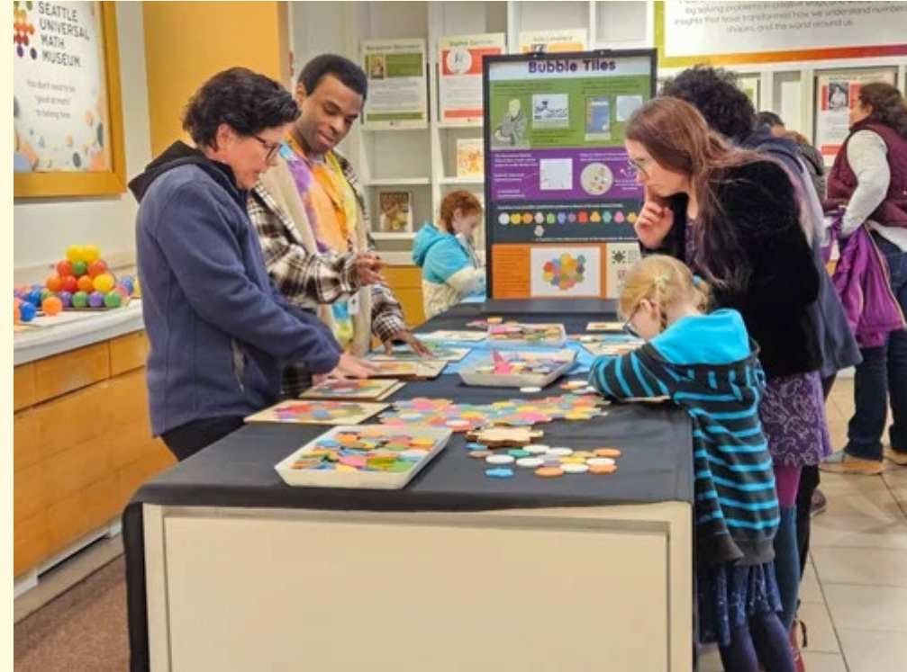
Seattle Universal Math Museum demonstration.