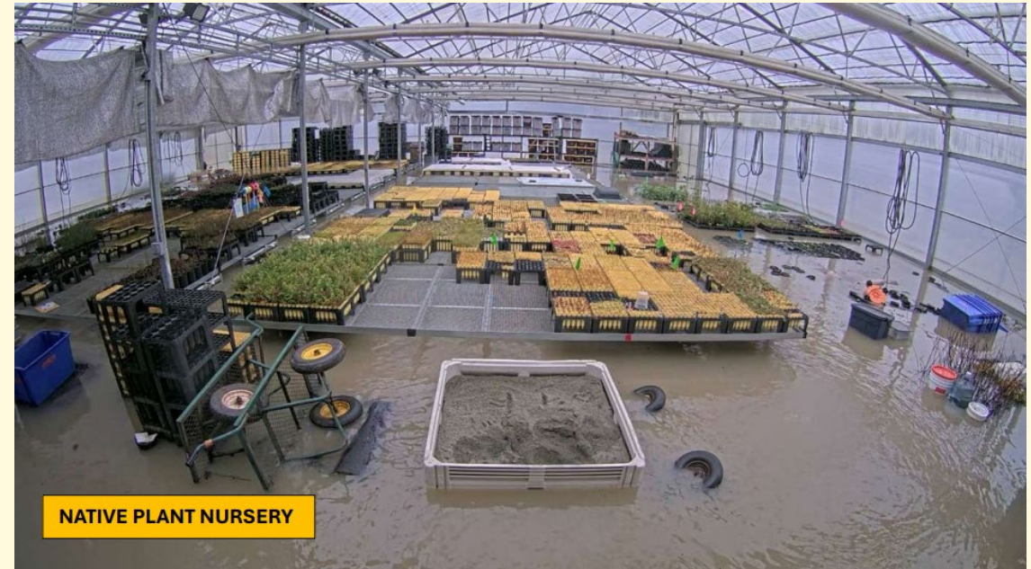
Flooded Native Plant Nursery at Oxbow Farm and Conservation Center, 2005.