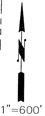
EXHIBIT D1 THE RIDGE AT LAKE SAWYER ANNEXATION AREA