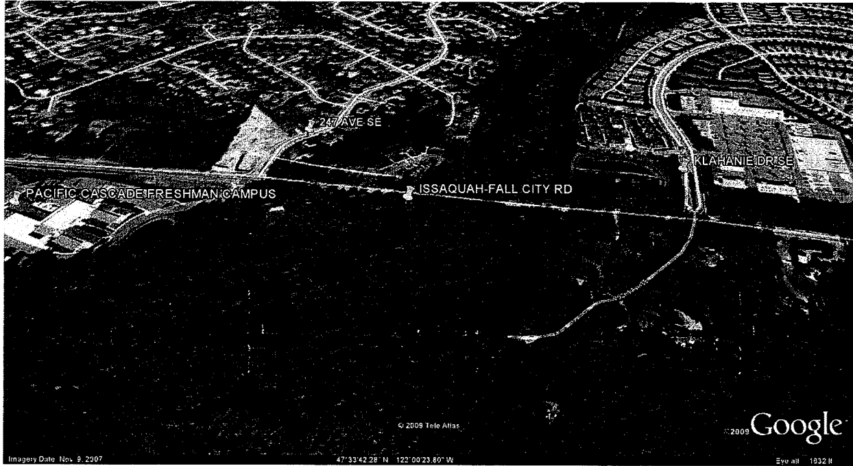
SE Issaquah-Fall City Road

The RSD has received approval from the state to obligate the $795,000 of grant funds. The RSD has been in close communication with the Issaquah School District and both parties concurred the delay in completing the project is far outweighed by the added benefits of the lighting and concrete sidewalk made possible by the grant monies. The project has been advertised and bids opened on December 2, 2009. The preliminary review of the bids is very favorable and the project should be completed under budget. The project is expected to be underway by early January. RSD continues to work closely with the Issaquah School District.