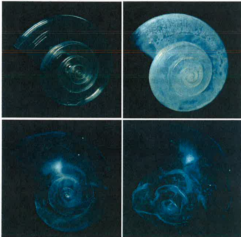
Figure S-1. The pteropod, or “sea butterfly,” is a tiny sea snail about the size of a small pea that plays an integral role in marine food webs. The photos above show what happens to a pteropod’s shell when placed in seawater with pH and carbonate levels projected for the year 2100. The shell slowly dissolved over 45 days.

Ocean acidification also has implications for the broader marine environment. Many calcifiers provide habitat, shelter, and/or food for various plants and animals. For example, rockfish and sharks rely on habitat created by deepwater corals off the Washington coast. Pteropods, the delicate free-swimming snails eaten by seabirds, whales, and fish (especially Alaska pink salmon), can experience shell dissolution and grow more slowly in acidified waters (Figure S-1). Some species of copepods, the small crustaceans eaten by juvenile herring and salmon, experience similar problems with growth. Impacts on species like pteropods and copepods are a significant concern because of their ability to affect entire marine food webs.