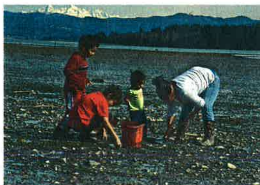
A Lummi family digs clams in Puget Sound. Shellfish are an important source of nutrition for Indian people in western Washington.

Ocean acidification also has important cultural implications. To Washington's tribal communities, ocean acidification is a natural resource issue and a significant challenge to their continued identity and cultural survival. With salmon at just a fraction of their former abundance, tribal fishers are depending more on shellfish to support their families; almost all of the commercial wild clam fisheries in Puget Sound are tribal. The tribes also harvest wild shellfish for ceremonial and subsistence purposes.