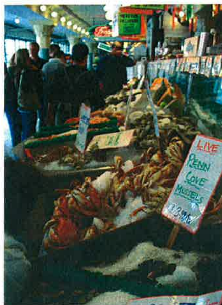
Pike Place Market, Seattle. Local seafood is an important economic driver for the state's economy.

Washington is the country's top provider of farmed oysters, clams, and mussels. Annual sales of farmed shellfish from Washington account for almost 85 percent of U.S. West Coast sales (including Alaska). 2 The estimated total annual economic impact of shellfish aquaculture is $270 million, with shellfish growers directly and indirectly employing more than 3,200 people. 3 Shellfish are also an integral part of Washington's commercial wild fisheries, generating over two-thirds of the harvest value of these fisheries. 4 Shellfish of ecological and economic importance include oysters, mussels (native and Mediterranean), clams (e.g., geoduck, razor, littleneck, Manila), scallops, Dungeness crab, shrimp (e.g., spot prawns, pink shrimp), pinto abalone, and urchins.