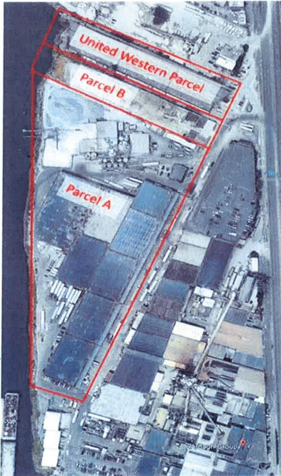
Exhibit B Diagram of the Premises