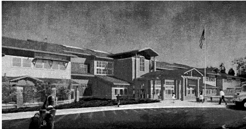
New Panther Lake Elementary School opened in Fall 2009

Kent School District No. 415 provides educational service to Residents of Unincorporated King County and Residents of the Cities of Kent, Covington, Auburn, Renton Black Diamond, Maple Valley, and SeaTac, Washington