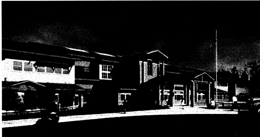
New Panther Lake Elementary School opened in Fall 2009

Kent School District No. 415 provides educational service to Residents of Unincorporated King County and Residents of the Cities of Kent, Covington, Auburn, Renton Black Diamond, Maple Valley, and SeaTac, Washington