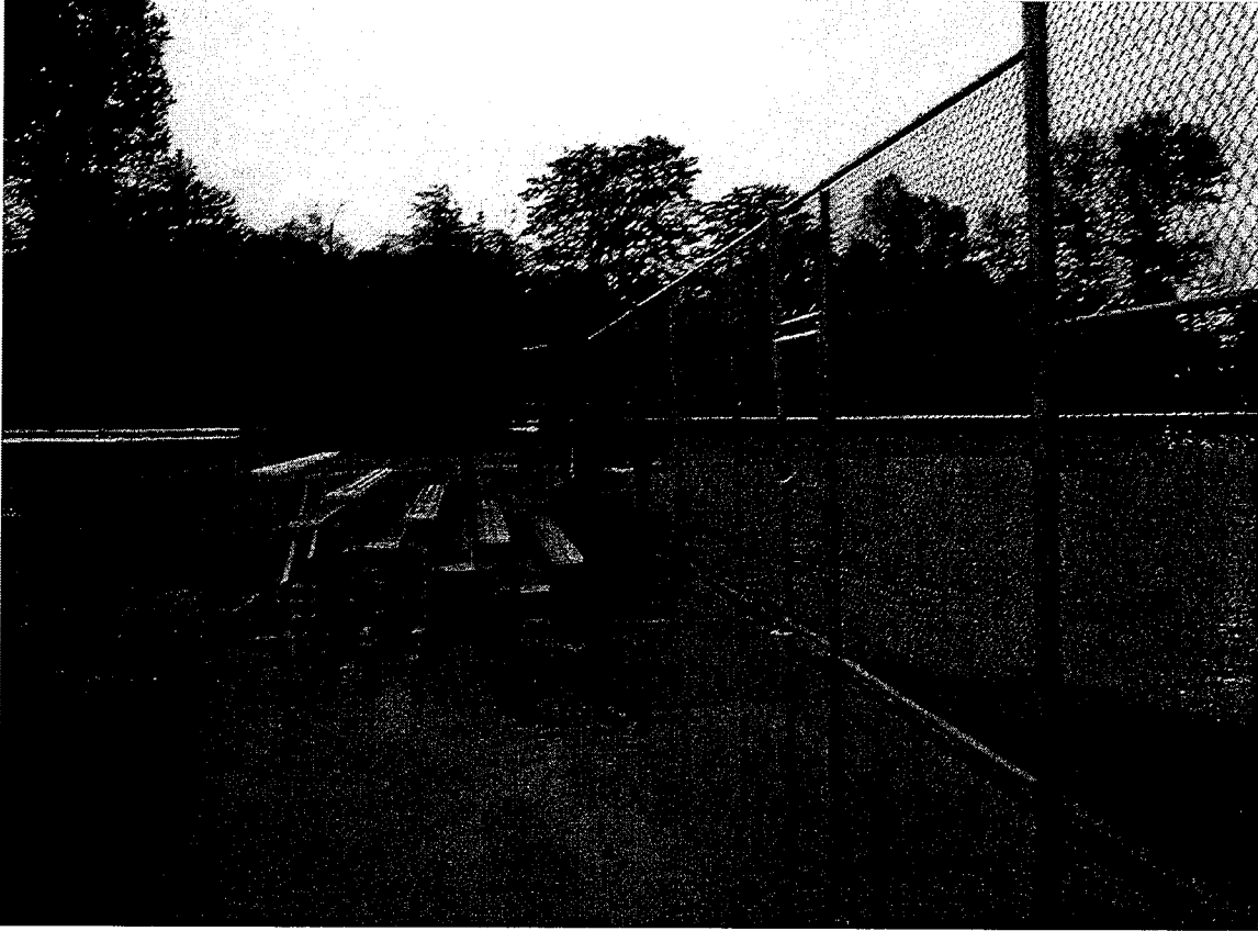
EXHIBIT E-3 Lake Meridian Park