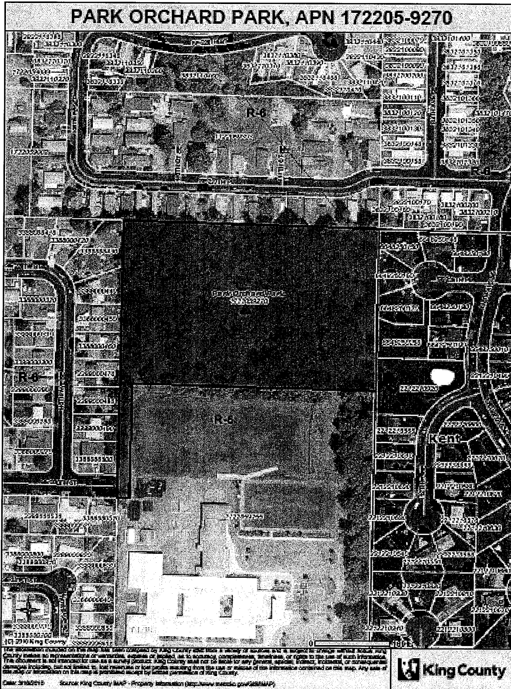
Image below is a color aerial photo of the area as described above.