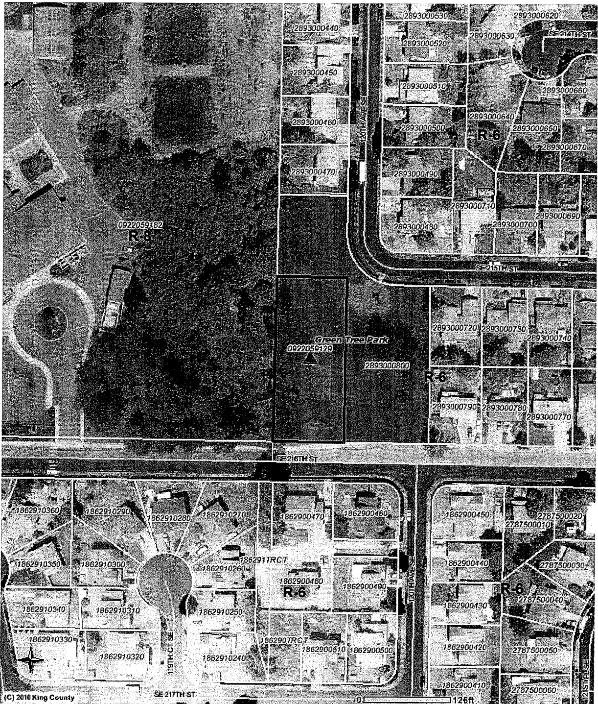
Image below is a color aerial photo of the area as described above.