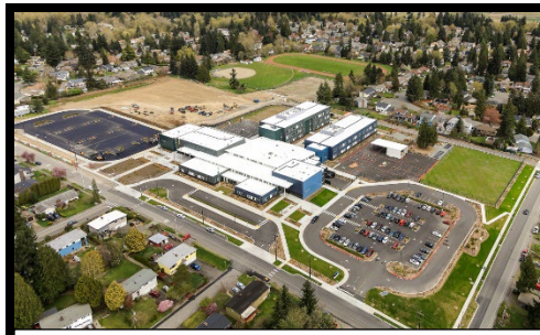
Star Lake Elementary/ Evergreen Middle School