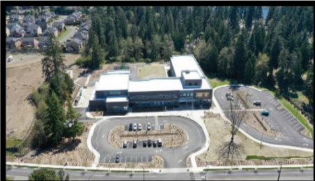
Lake Grove Elementary

Each Scholar: A voice. A dream. A BRIGHT future.