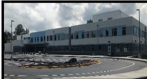
Mirror Lake Elementary