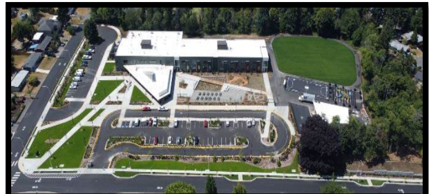
Olympic View K-8 School