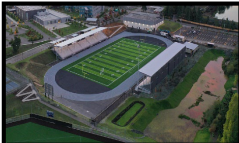
Memorial Field Renovation