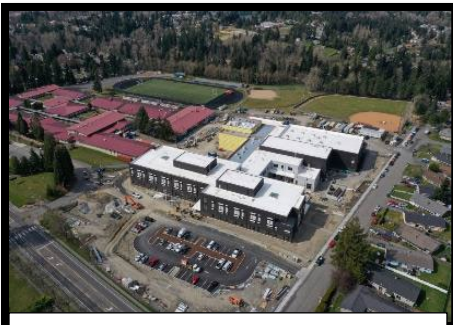
Thomas Jefferson High School