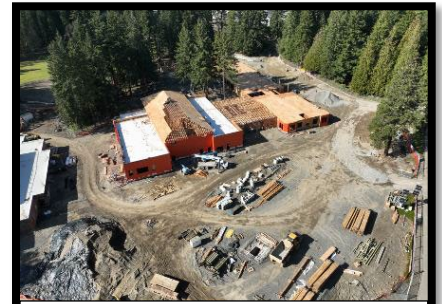
Illahee Middle School