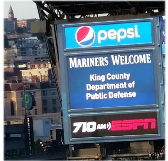
DPD staff also finds time to have fun together. In 2016, we went to a Mariners' game; we even got a welcome announcement on the scoreboard.