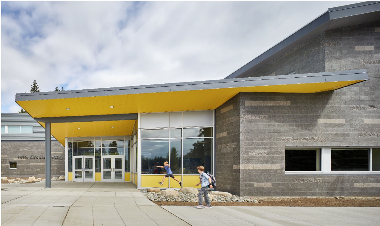
Peter Kirk Elementary School – Opened Fall 2019