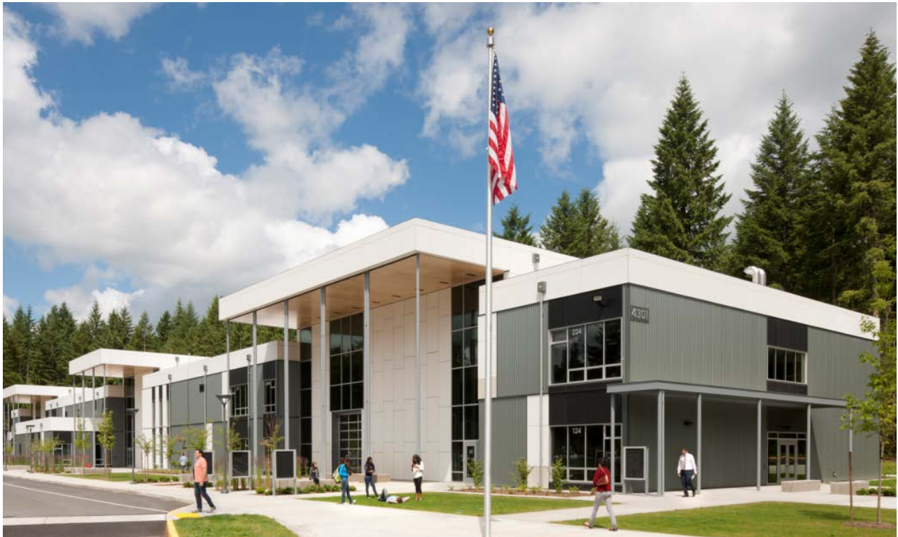
Nikola Tesla STEM High School