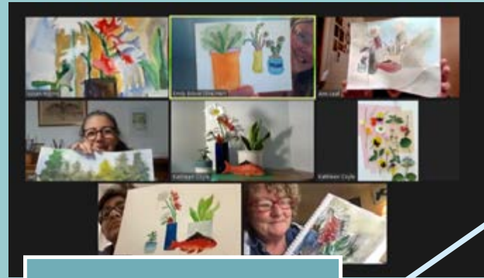
Kathleen Coyle. Zoom watercolor class for seniors (Creative Response Fund) © 2020

Perhaps the most critical component of what resulted from these early-COVID questions was our Cultural Relief Fund. With support from the King County Council, the federal CARES Act, and our budget, we were able to distribute $4.6 million to 1,111 organizations and cultural workers across all County districts. The grants rolled out in three phases—April, June, and October—and prioritized applicants with the highest levels of need via several indicators including the King County/Seattle Foundation Community of Opportunity Index.