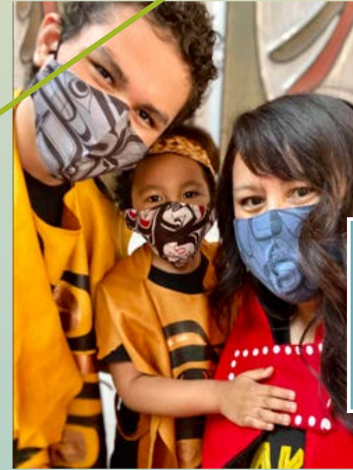
Haida Roots. Language and Youth Arts program (Cultural Relief Fund) © 2020

In February, the Task Force drafted the Recovery Framework, a roadmap to rebuilding King County's cultural sector after the impacts of COVID-19 and a vision and approach toward a full and equitable recovery. The Task Force will continue to meet through August to advise 4Culture on a Recovery Program and to share their own efforts towards a new, more equitable recovery.