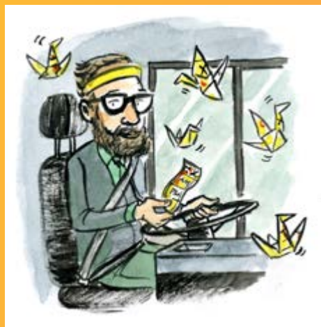
Aaron Bagley, Top: Crane Transfers Driver, Middle: Modern Rapid Ride; Bottom: Expansion Riders (RapidRide Expansion Art Plan) © 2020