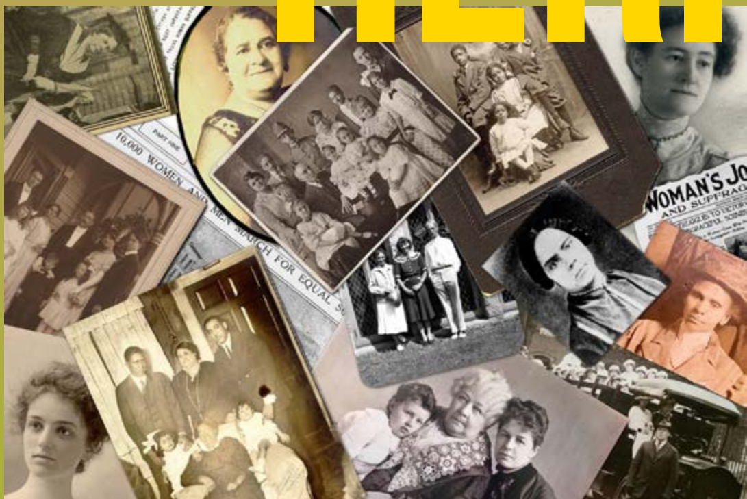
Ain't (Y) Our History © 2020.

Playwright Rachel Atkins's research-based play Ain't (Y) Our History is about the lesser told stories of race relations within the women's suffrage movement. It was originally intended as a free public presentation to encourage community engagement around equity and voting rights. After the COVID-19 shutdown, it shifted to an online reading with the actors and Azeotrope theatre spending significant time to make the new platform work. In conjunction with a livestream panel, part of Washington's Votes for Women Centennial, the performance reached 1,200 people.