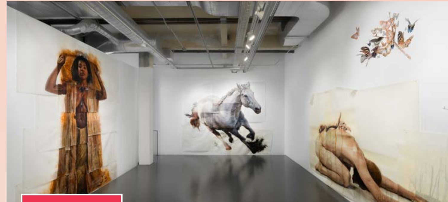
Nichole DeMent. Future Memory (Gallery 4Culture) © 2020.