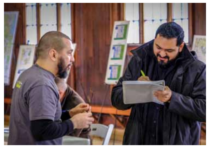
3,500 residents participated in job fairs and other employment events supported by COO.

Place-based solutions and policy/system change solutions are most effective when community partners have key roles in leading, shaping and implementing change in their communities.