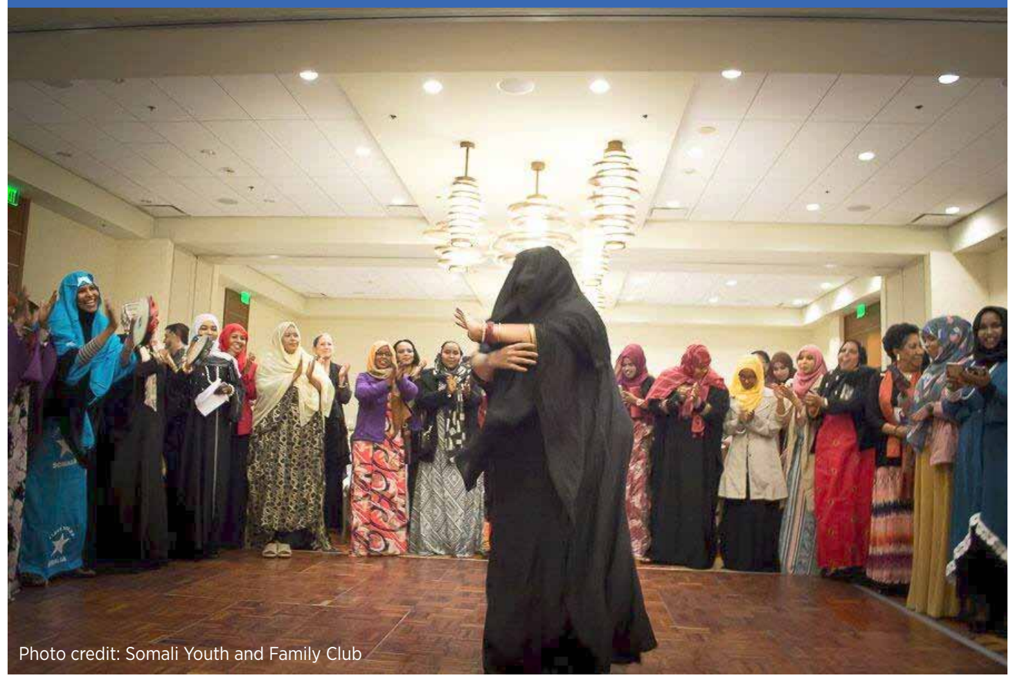
Somali Youth and Family Club chose this image to reflect their work and community—demonstrating resilience and hope.