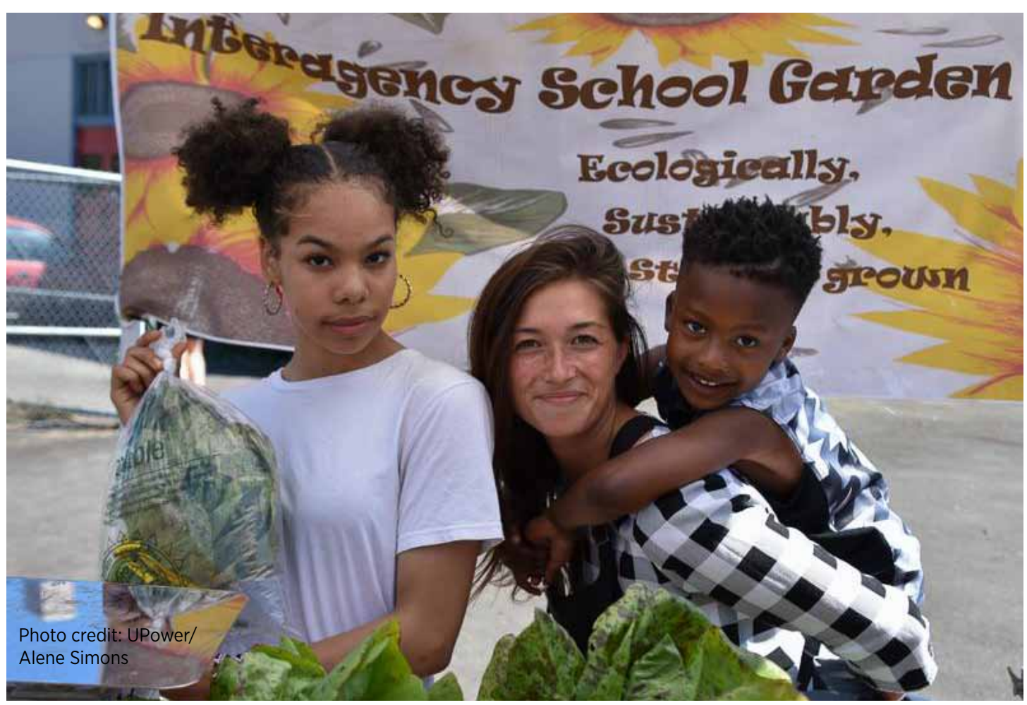
Students show produce grown at Seattle Public Schools' Interagency Academy School Garden. With funding from Best Starts for Kids, UPower provides summer community gardening classes, physical activity classes, and safe afterschool activity spaces for students at Interagency Academy.