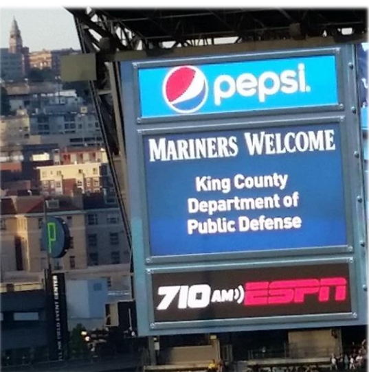
DPD staff also finds time to have fun together. In 2016, we went to a Mariners' game; we even got a welcome announcement on the scoreboard.