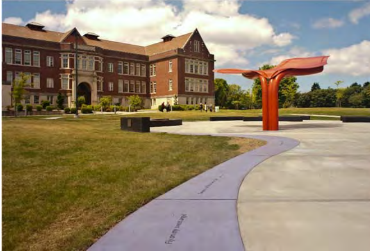
Central Shelter at Jimi Hendrix Park