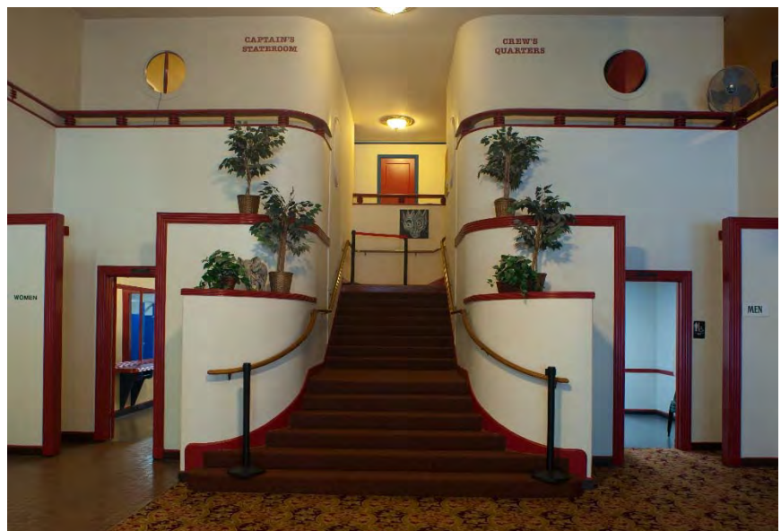
Admiral Theater

The Admiral Theater was restored and modernized to remain competitive with other Seattle movie theater venues. The Admiral Theater serves the Duwamish peninsula, an increasingly diverse area of Seattle. The total project budget was $1.2 million, and acts as catalyst for economic development in neighborhood.