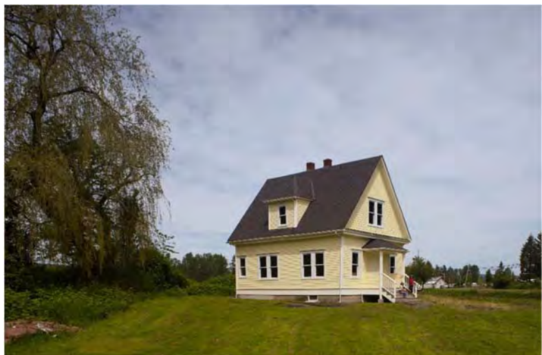
Tollgate Farm

The Tollgate Farmhouse exterior restoration was done with bond funding. This is the first of multiple phases, and makes the historic farmhouse available for community use. THIS PROJECT IS NOW COMPLETE BUT HAS NOT INVOICED 4CULTURE. They should finish their report in July 2017.