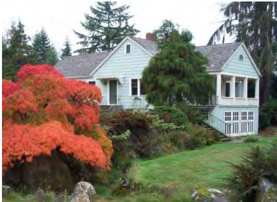
Mukai House