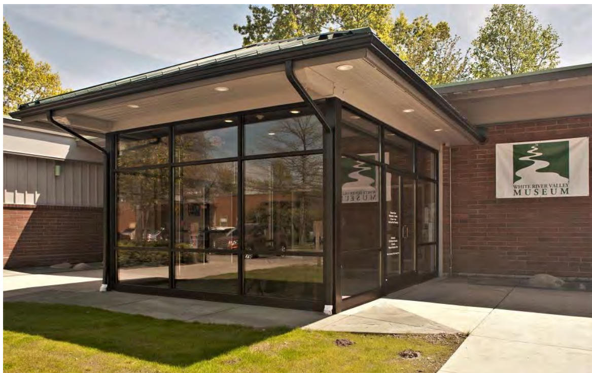
White River Valley Museum © 2017 Eduardo Calderón

The WSJHS is creating an exhibit gallery to showcase the unique history of the Jews of King County and Washington State.