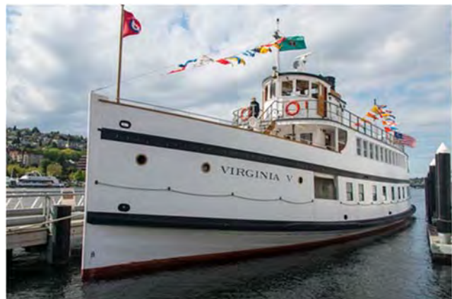
Virginia V

The Steamer Virginia V Foundation was awarded Saving Landmarks funds, which went towards the purchase of marine lumber that will be used to reframe the stern of the SS VIRGINIA V. This is part of a long-term restoration plan.