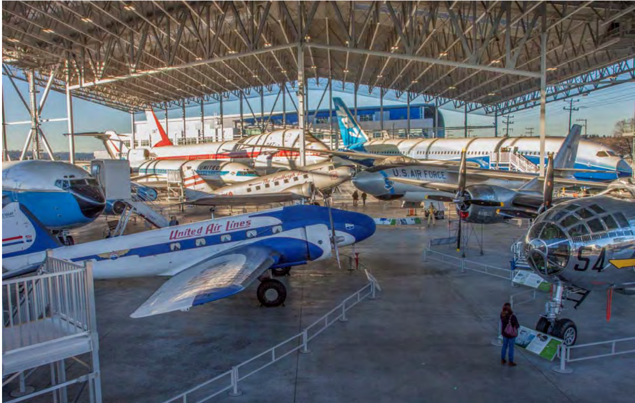
Museum of Flight

The Music Works Facility renovation project included the construction of teaching studios, music therapy rooms, classrooms, office spaces, soundproofing, and upgrades to the HVAC system and restrooms.