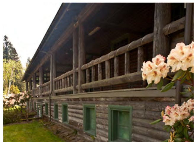
Enumclaw Expo and Events Center

The Enumclaw Expo and Events Center includes this WPA-built fieldhouse. In an effort to maintain its functionality, the maple floor was refinished, the front porch was repaired, electrical boxes were updated, the building was insulated, air conditioning was installed, and an appropriate road sign identifying the historic building was added.