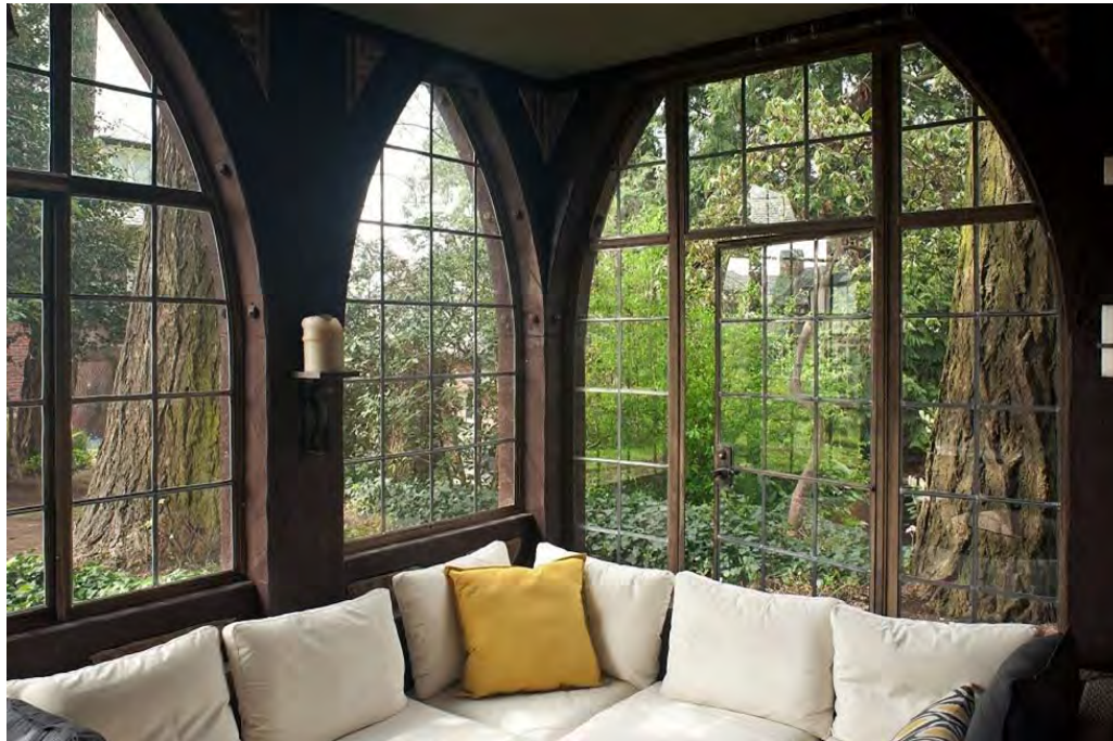
Louis S. Marsh House

The Kenmore Community Club rehabilitated the interior of their building, making improvements primarily to the kitchen to promote the building's continued use as a community gathering place.