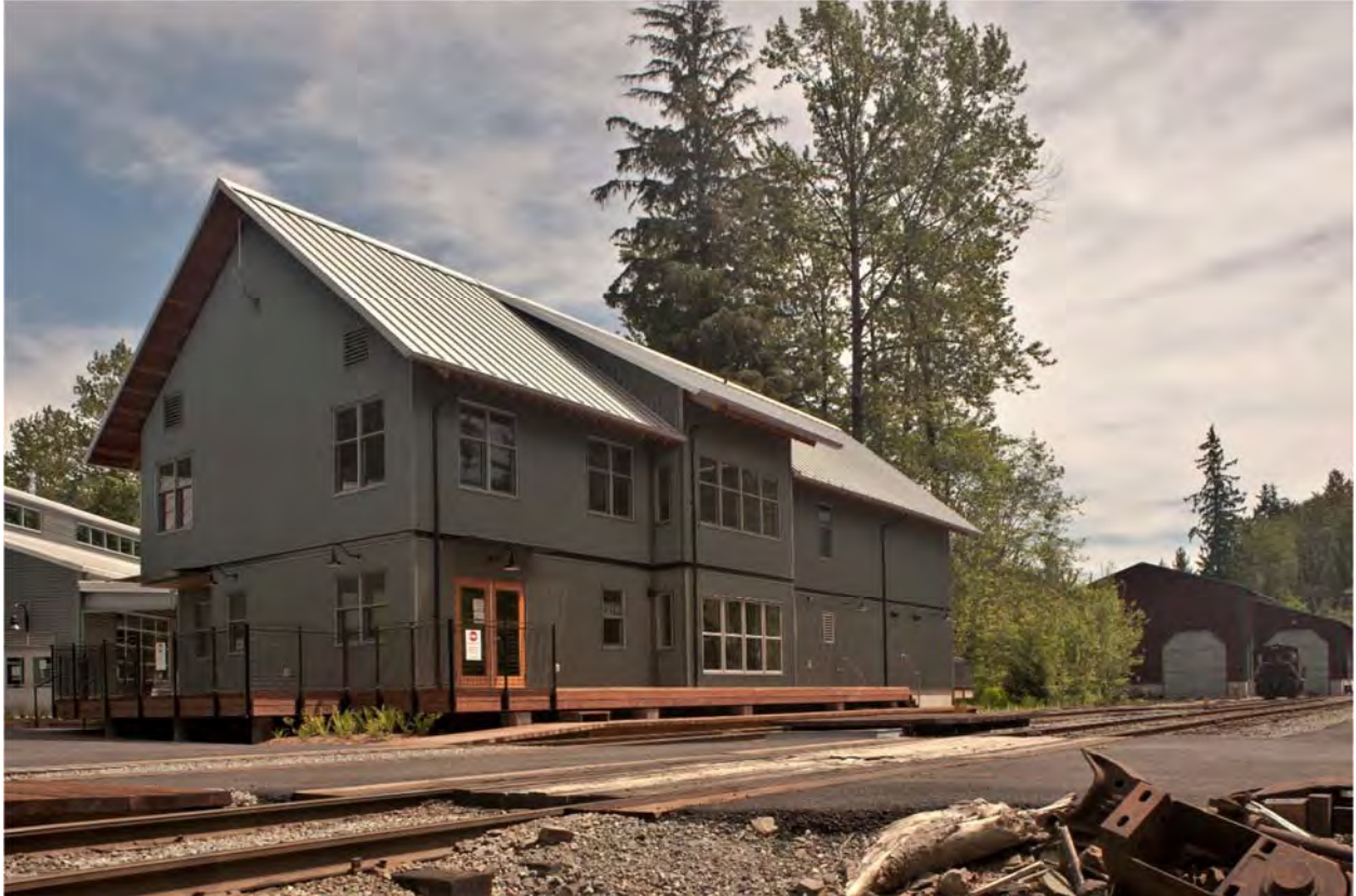
Northwest Railway Museum, Railway Education Center