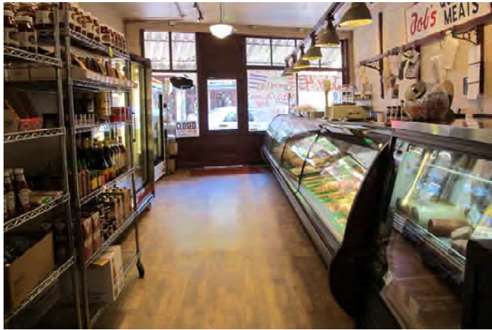
Bob's Quality Meats

The Blessed Sacrament Parish is a strong steward of this landmark property. The rectory stained glass window project is the final step in their extensive renovations to address building envelope issues for long-term building stability. The Blessed Sacrament Parish provides a wide range of public services to the homeless and people in need in the University District.