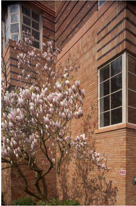
Pacific Tower