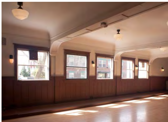
Washington Hall

The Highline Heritage Museum is an important addition to Burien's Downtown. Demolition is completed, and construction will continue into next year.