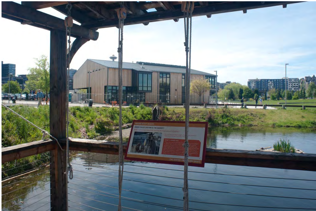
Center for Wooden Boats, Wagner Education Center