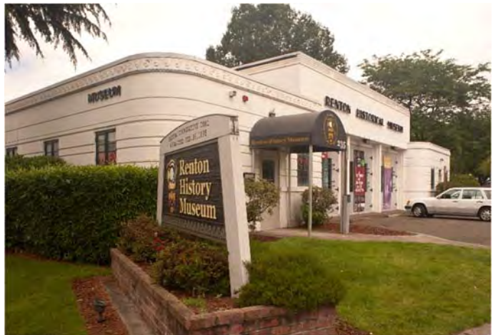
Renton History Museum

The Renton Historical Society is renovating the 30-year old Renton History Museum lobby, mitigating hazardous materials, improving disabled accessibility, and bringing lobby up to code. The project will ultimately create a safer, more accessible, and more educational entrance to museum programs and exhibits.