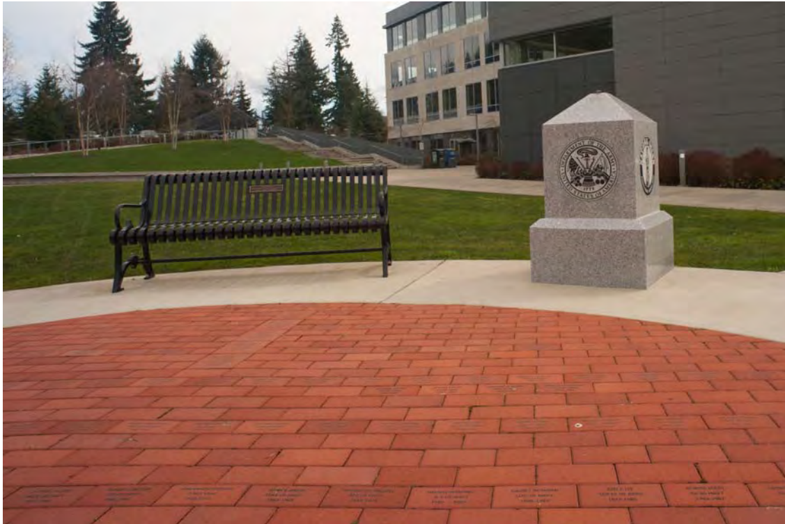
Shoreline Veterans Recognition Plaza