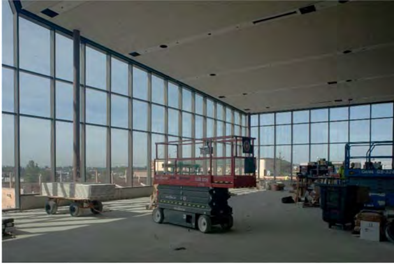
Federal Way Performing Arts & Event Center