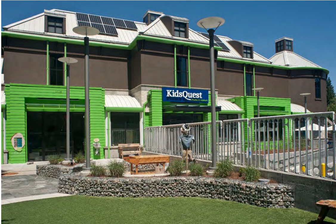
KidsQuest Children's Museum © 2017 Eduardo Calderón