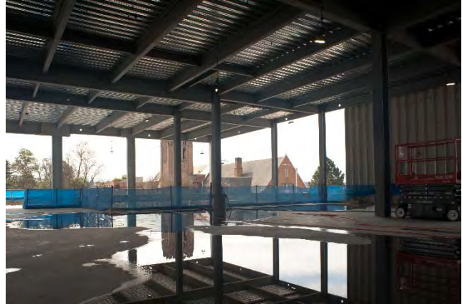
The New Burke

The Burke Museum of Natural History and Culture is engaged in a multi-year transformation project, to culminate in a new flagship museum in 2019. The project will greatly increase public access to the museum collections.