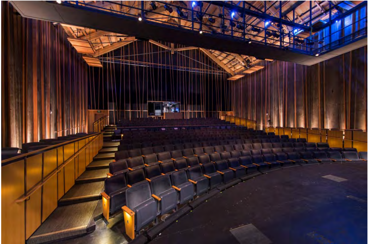
Vashon Center for the Arts facility