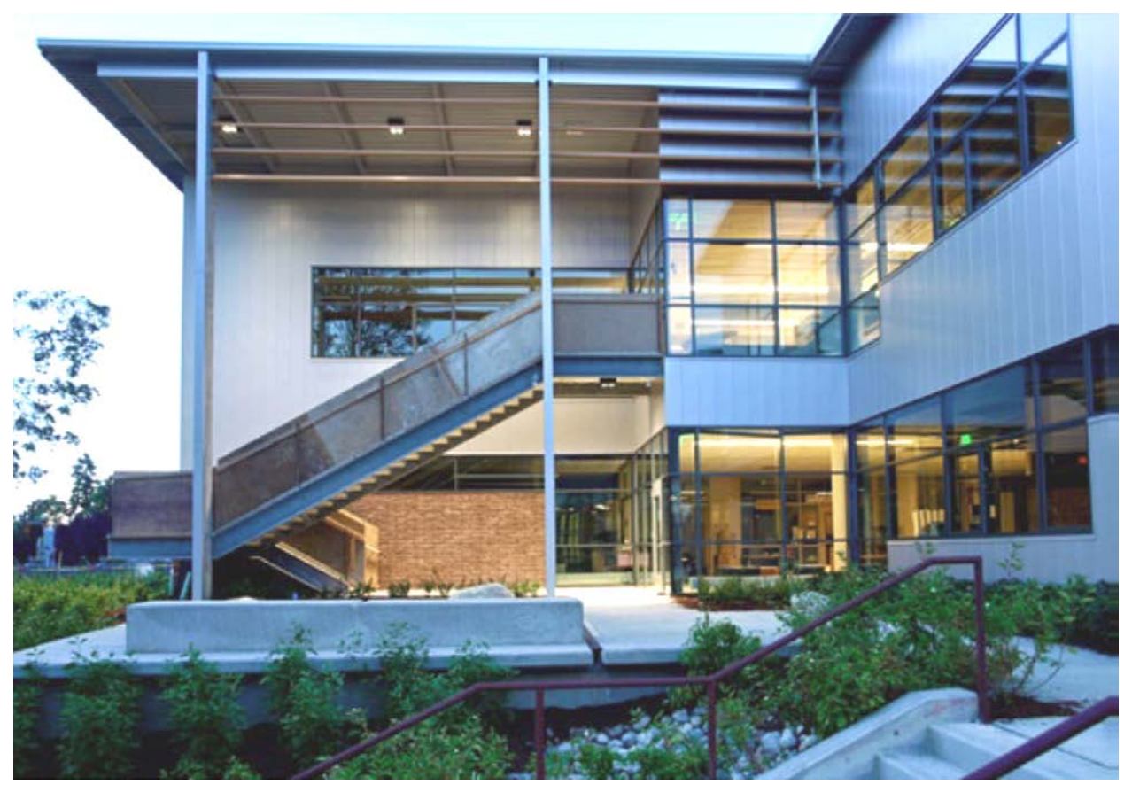
Carl Sandburg Elementary