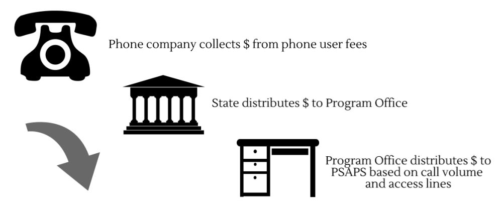
Exhibit C: E911 Program Office supports PSAPs through distribution of excise taxes

12 PSAPS answer 911 calls and dispatch emergency service