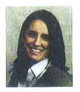
Title Technical Discipline Lead