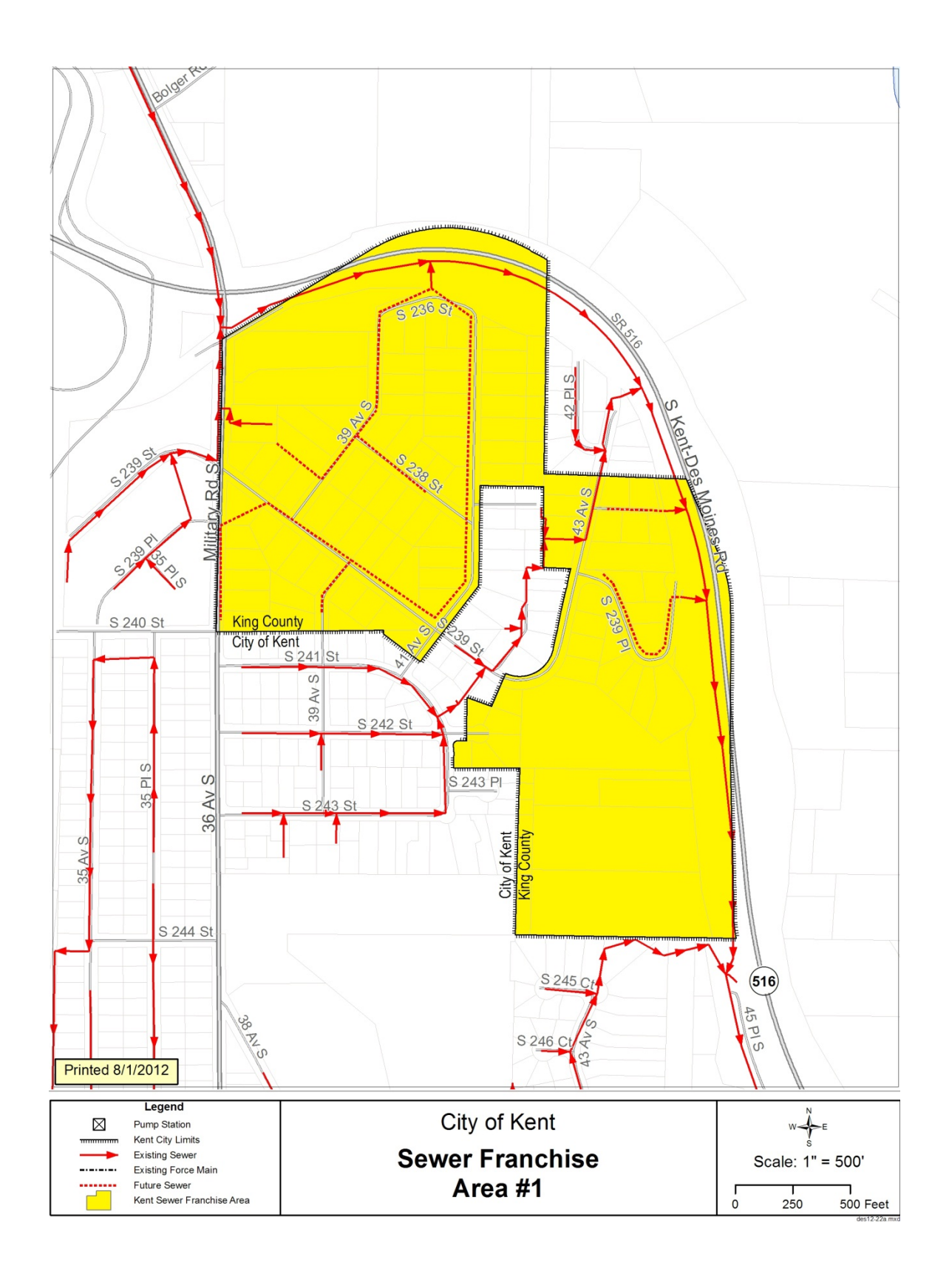
42 Sewer Franchise